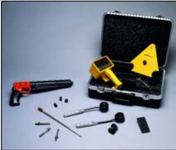
The Windsor HP Probe System.