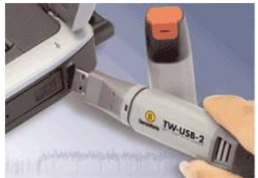
Plugs directly into USB port. No cable or adapter required.

With an IP 67 rating, our TW-USB-1 and TW-USB-2 loggers are water resistant and can log in the harshest environments. Store up to 16,382 readings at temperatures to 176°F.