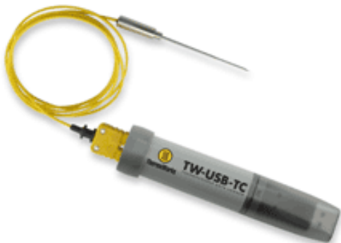
Plug any Type K thermocouple into the TW-USB-TC logger.